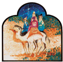
Magi from the east arrived